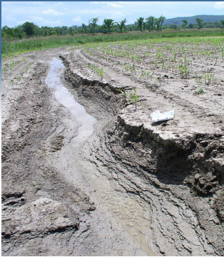
Gully resulting from soil erosion