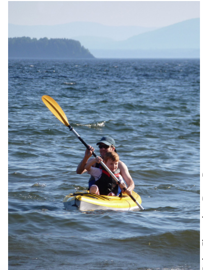
Lake Champlain Basin Program