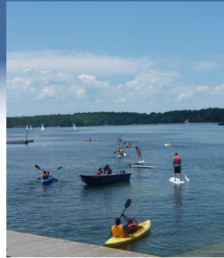
Various watercraft utilize Burlington Bay