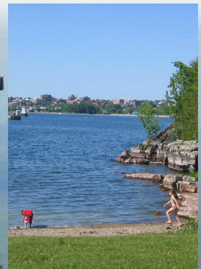
Lake Champlain Basin Program